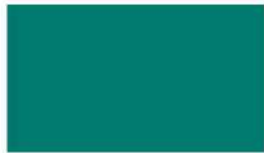
DEEP WATER GREEN